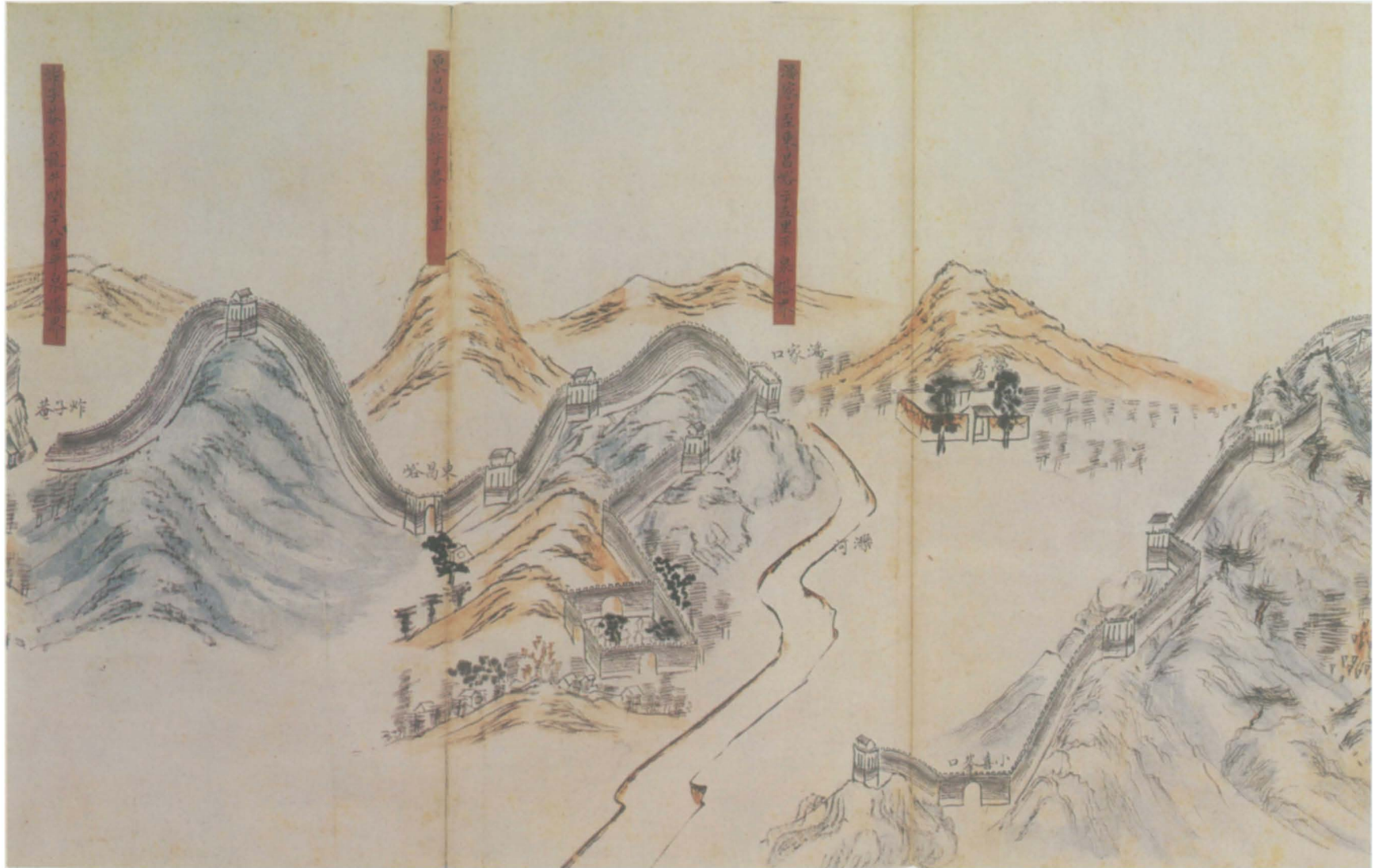
PLATE 11. DETAIL FROM AN EARLY EIGHTEENTH-CENTURY MAP OF THE GREAT WALL. (See p. 189.) The entire map, drawn in the late Ming, represents the section of the Great Wall extending from Shanhaiguan to Luowenyu, a span of about six hundred kilometers. Distance between guard stations on the wall is given on red strips pasted to the map.

Size of the entire original: 32 × 600 cm. By permission of the Staatsbibliothek zu Berlin—Preussischer Kulturbesitz, Kartenabteilung (19 271).