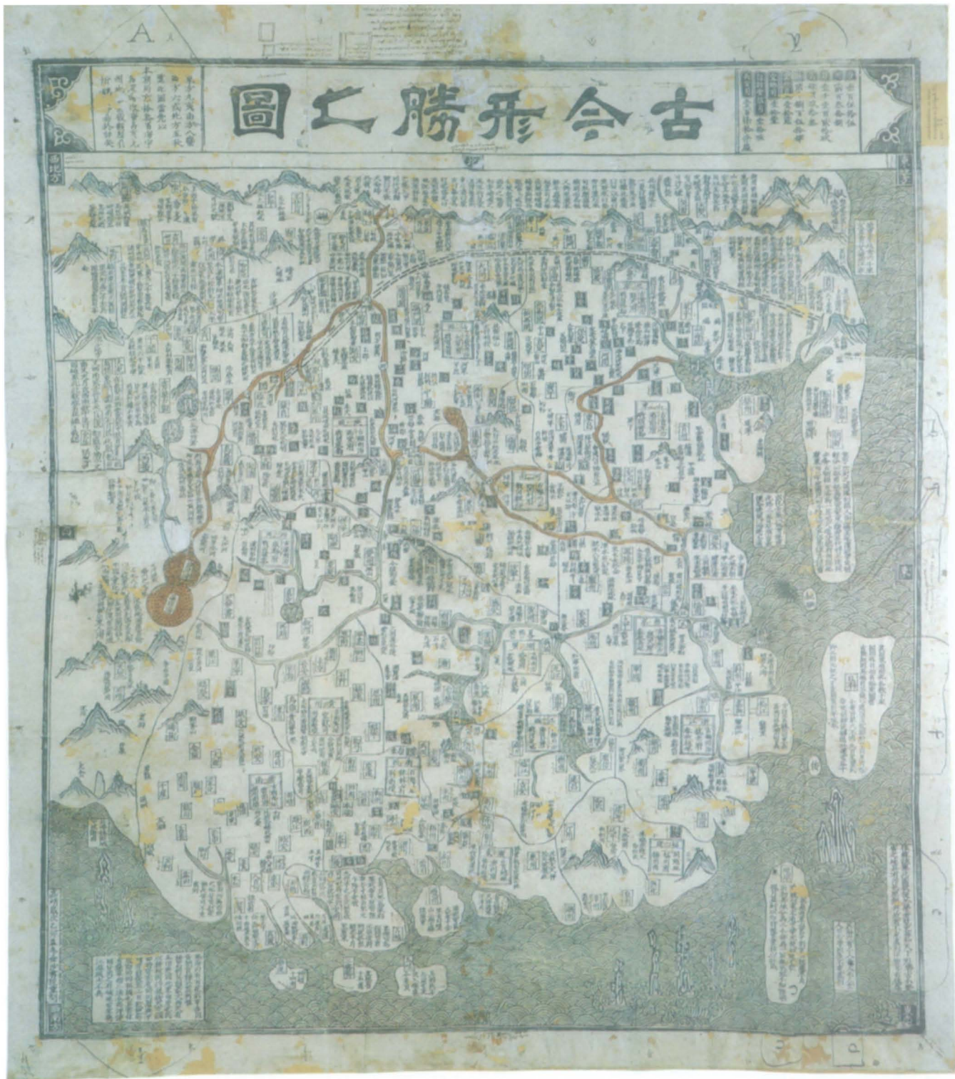
PLATE 1. GUJIN XINGSHENG ZHI TU (MAP OF ADVANTAGEOUS TERRAIN PAST AND PRESENT, 1555). (See p. 59.) This map represents territory from Samarkand in Central Asia to Japan and from present-day Mongolia to Java and Sumatra in Southeast Asia. The map was printed with black ink from a woodblock and colored by hand afterward. The Huanghe (Yellow River) is yellow, and the Changjiang (Yangtze River) is

blue. Mountains are represented pictorially, as is the Great Wall. Much of the map is covered by notes describing changes in place-names and administrative status. This map was sent to Spain in 1874 by the Spanish viceroy in the Philippines. Size of the original: 115 × 100 cm.