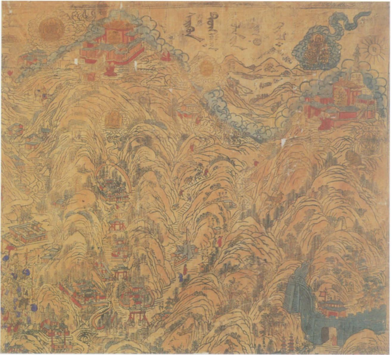
PLATE 14. PART OF A LATE QING MAP OF WUTAI SHAN. (See p. 191.) The map presents a panoramic view of Wutai Shan (in present-day Shanxi Province). The dark lines on the map were produced by a woodblock; the rest of the linen surface was hand colored. The map bears inscriptions in Chinese, Manchu, and Mongolian. It was made in 1846. The portion shown here is slightly less than one-quarter of the map. A nearly iden-

tical map is described and illustrated in Harry Halén, Mirrors of the Void: Buddhist Art in the National Museum of Finland (Helsinki: Museovirasto, 1987), 142–59. Size of this detail: ca. 59 × 64 cm. Courtesy of the Geography and Map Division, Library of Congress, Washington, D.C. (G7822.W8A3 1846.W8 Vault).