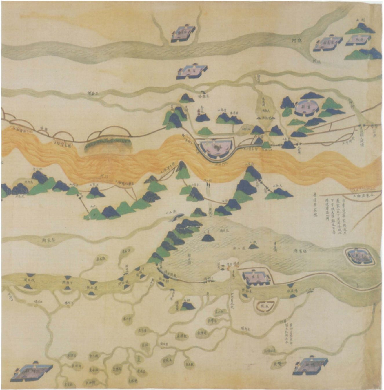
PLATE 5. SECTION OF A MAP OF THE GRAND CANAL LINKING BEIJING WITH HANGZHOU, EIGHTEENTH CENTURY. (See p. 101.) The thousand-mile length of the canal is represented on a scroll. While the waterway is drawn in plan,

mountains are presented in elevation and cities and towns from a bird's-eye view. Compare this map with figures 5.2 and 5.3. Size of this detail: ca. 49 × 47 cm. By permission of the British Library, London (MS. Or. 2362).