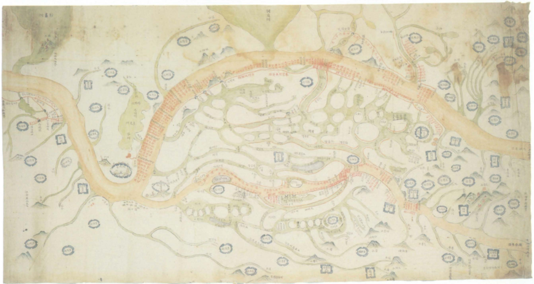
PLATE 2. CHANGJIANG TU (MAP OF THE YANGTZE RIVER). (See p. 61.) This map shows flood control works on the Yangtze and Han rivers in Hubei Province. It is oriented with north at the bottom.

Size of the original: 74 × 140 cm. Courtesy of the Geography and Map Division, Library of Congress, Washington, D.C. (G7822.Y3N22 18--C4 Vault).