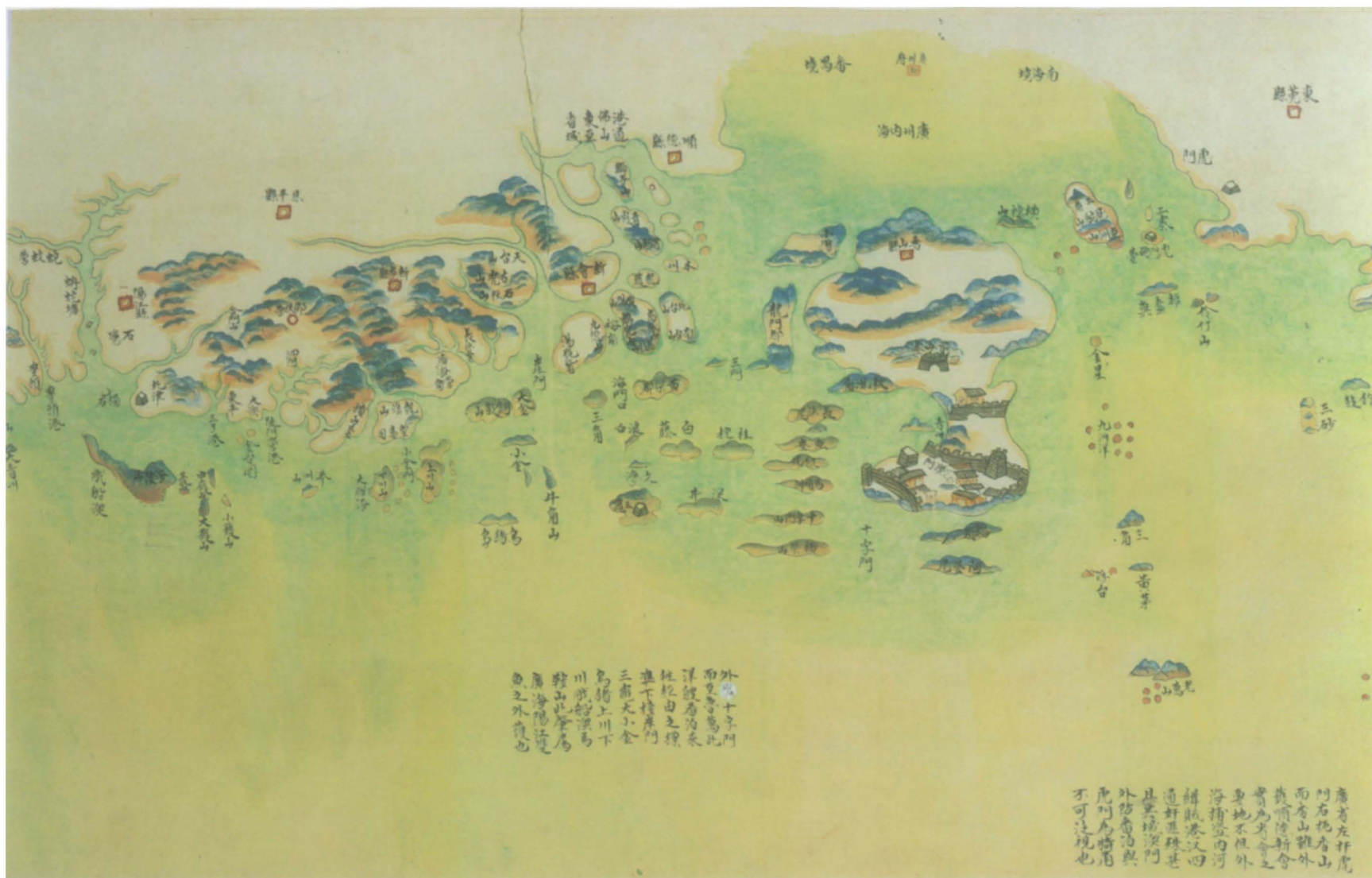
PLATE 4. DETAIL OF A CHINESE COASTAL MAP ON A SCROLL. (See p. 62.) This map represents the Chinese coast from Korea to Annam. According to the accompanying text, the map was intended as an aid to surveillance of the coast for the protection of commerce. Strategic points and harbors are

labeled. Mountains, walls, bridges, and temples are represented pictorially. Counties ( xian ) are represented as red squares. Size of the entire original: 30 × 900 cm.