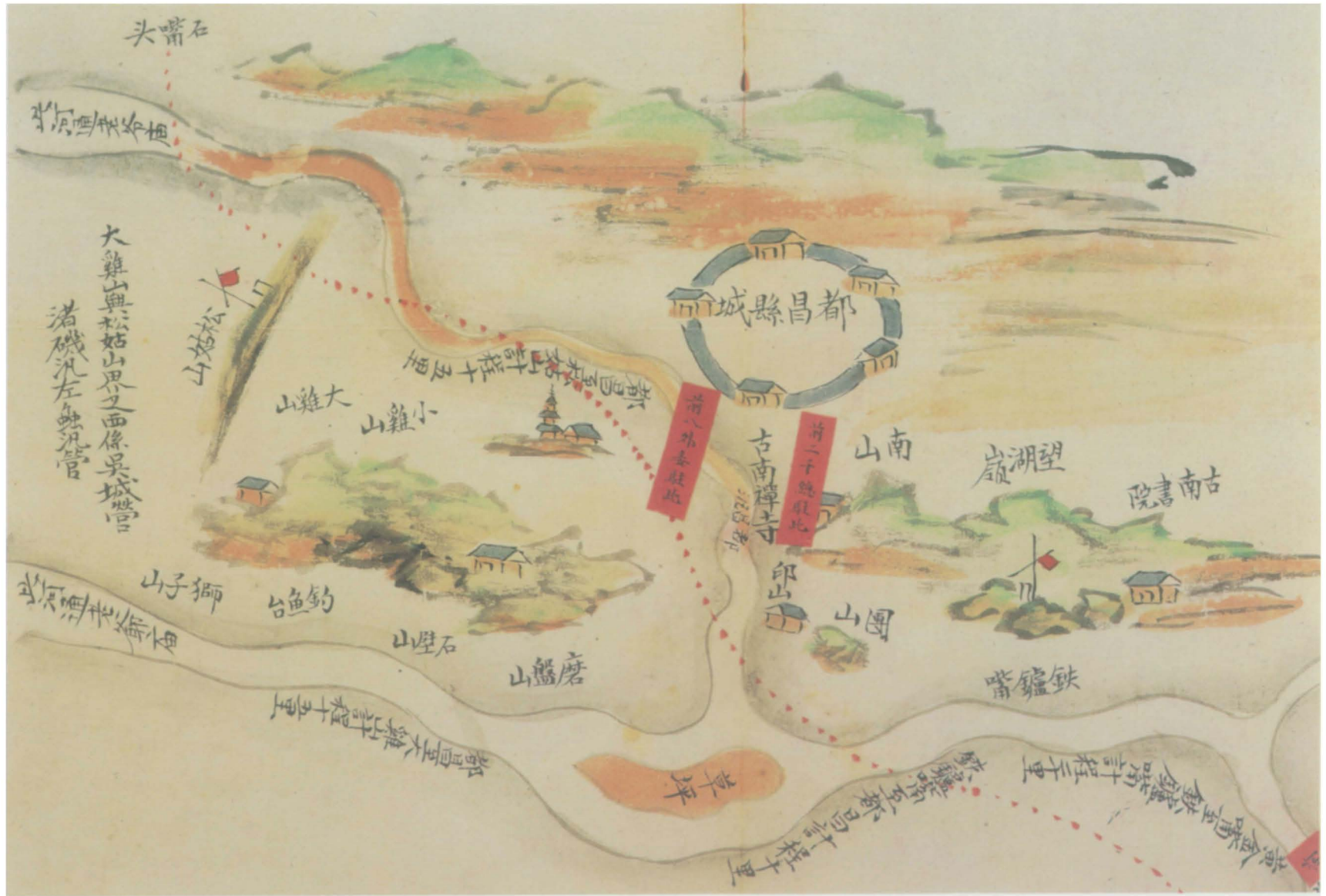
PLATE 3. WATER POLICE MAP, 1850. (See pp. 61–62.) This map represents the jurisdiction of the water police station at Tongzhou near the mouth of the Yangtze River. The red strips on the map give patrol instructions, distance information, and information about tributaries.

Size of the original: 63.5 × 96 cm. By permission of the Staatsbibliothek zu Berlin—Preussischer Kulturbesitz, Kartenabteilung (E 1155).