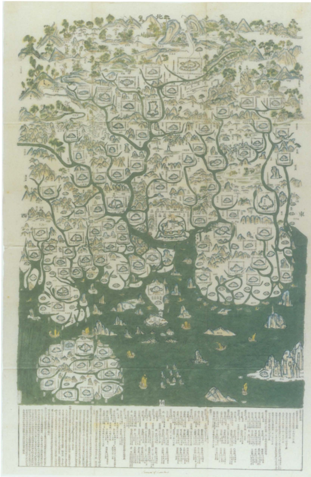
PLATE 13. MAP OF GUANGDONG PROVINCE, CA. 1739. (See p. 190.)

Size of the original: 163.5 × 103 cm. By permission of the owner.