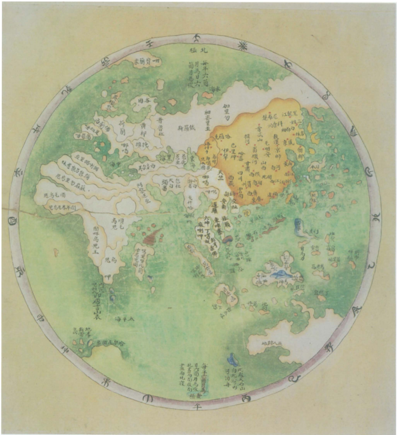
PLATE 15. CHINESE MAP OF THE EASTERN HEMISPHERE, 1790. (See pp. 195–96.) This map was drawn at the beginning of a scroll devoted mainly to a coastal map (p. 62 and plate 4).

Diameter of the original: ca. 25 cm (?). By permission of the Staatsbibliothek zu Berlin—Preussischer Kulturbesitz, Kartenabteilung (E 530).