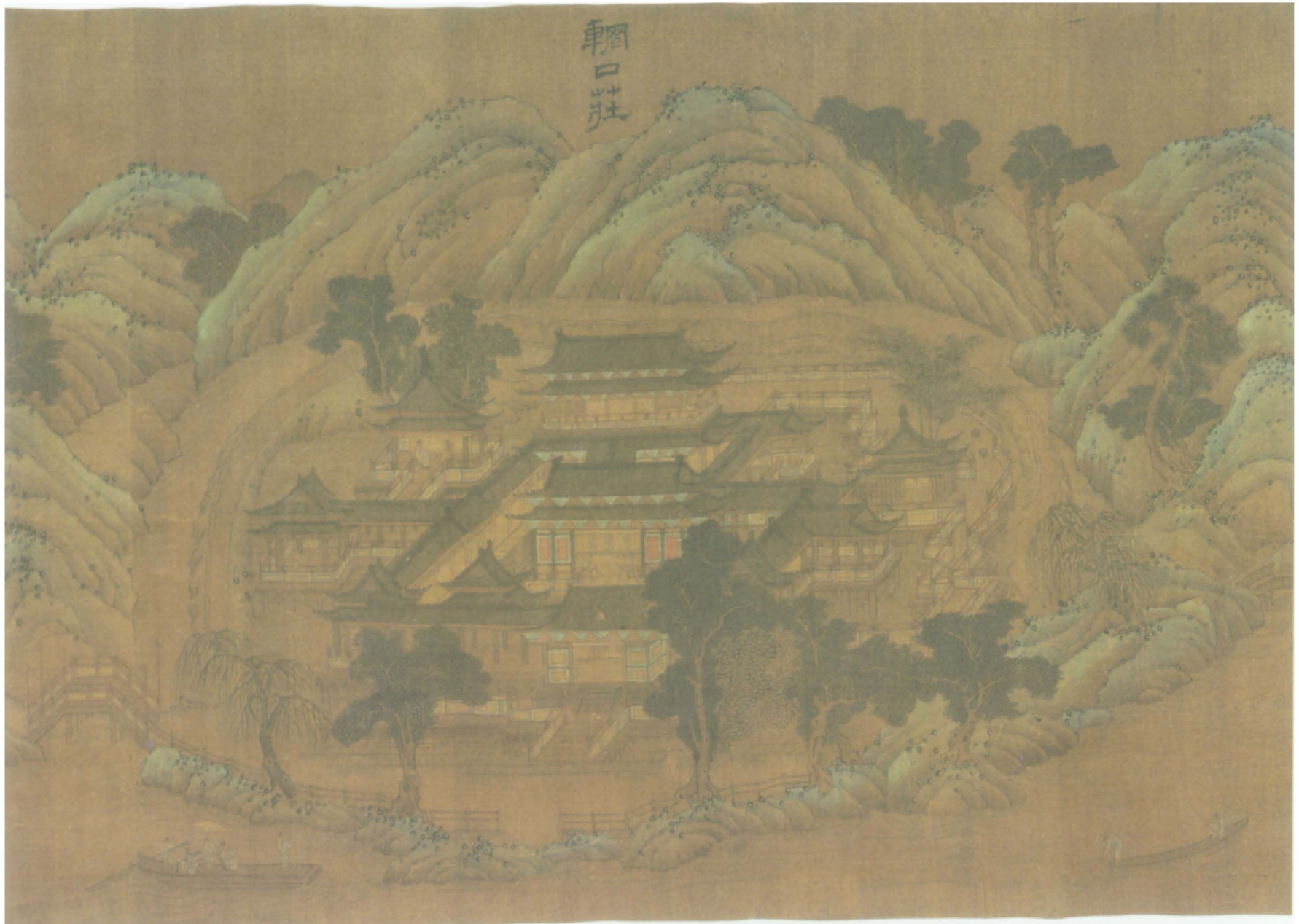
PLATE 9. DETAIL FROM THE PAINTING OF WANG- CHUAN. (See p. 151 and fig. 6.17.)

Size of the detail: unknown.