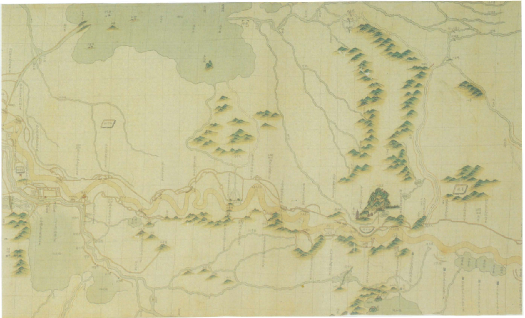
PLATE 12. DETAIL OF A NINETEENTH-CENTURY MAP OF THE YELLOW RIVER. (See pp. 189-90 and fig. 7.21.) Size of the detail: ca. 38 × 64 cm. Courtesy of the Geography

and Map Division, Library of Congress, Washington, D.C. (G7822.Y4A5 18--H9 Vault Shelf).