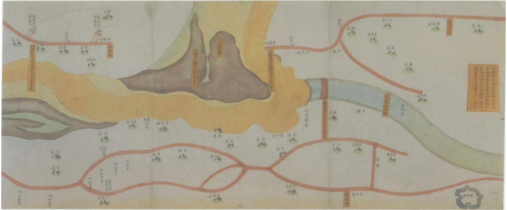
PLATE 7. QING MAP OF THE YELLOW RIVER. (See p. 102.) This map depicts the conservancy works along the Yellow River at Lanyi Xian (in present-day Henan Province). It was presented to the emperor with a memorial.

Size of the original: ca. 30 × 76 cm.