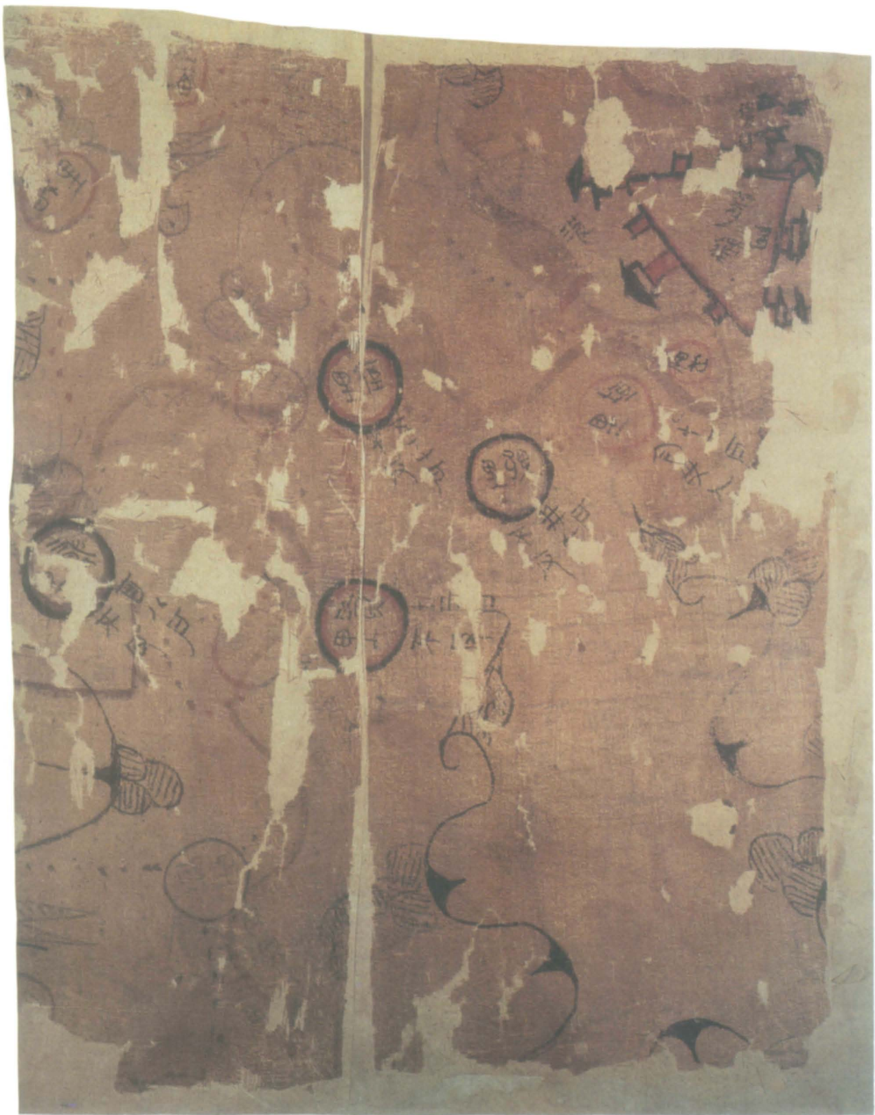
PLATE 8. DETAIL OF A SILK MAP FROM THE HAN DYNASTY. (See pp. 147–48.) Detail of the garrison map drawn on silk discovered in Han tomb 3 at Mawangdui. See also figure 3.10 above.

Size of this detail: ca. 25 × 19 cm.