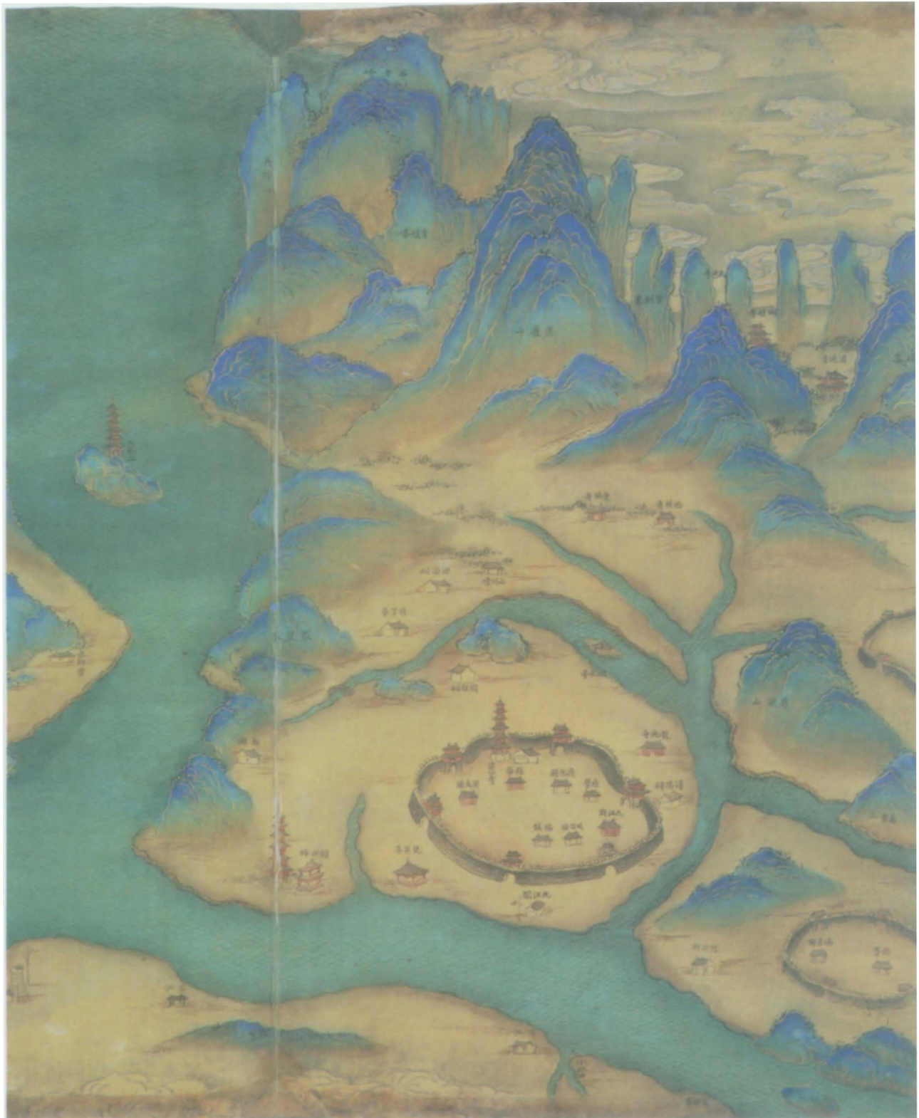
PLATE 10. DETAIL FROM A PREFECTURAL MAP FROM AN EIGHTEENTH-CENTURY MANUSCRIPT ATLAS OF JIANGXI PROVINCE. (See pp. 152–53.)

Size of the entire original: ca. 40 × 53 cm; this detail: ca. 35 × 27 cm. By permission of the British Library, London (Add. MS. 16356).