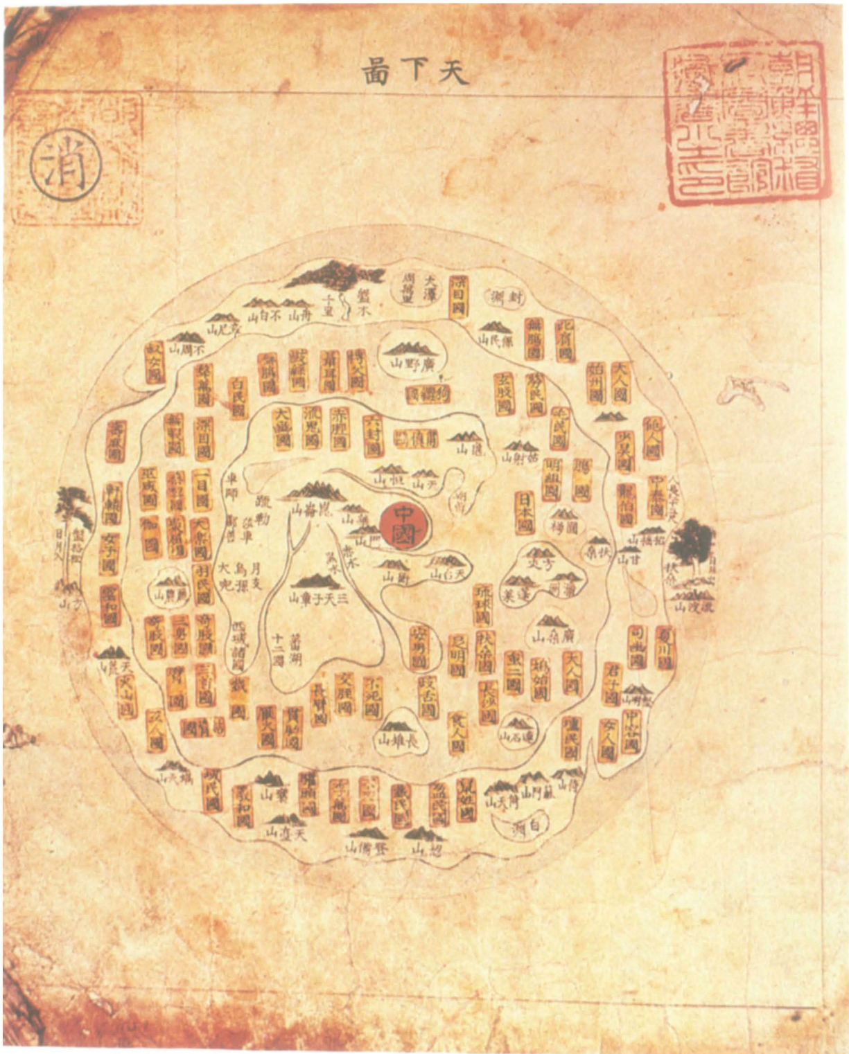
PLATE 16. CH'ŌNHADO (MAP OF THE WORLD). (See p. 259.) From a hand-copied atlas of perhaps the mid-eighteenth century. Although this map differs from other ch'ōnhado in a few minor details, it may be called a typical example of the genre. The inner continent is encircled by a sea with various fabulous countries and mountains; the sea is surrounded by an equally fictional outer land ring. Trees at the east and west mark

the places where the sun and moon rise and set. Another tree decorates the outer ring in the north. The names of most of the fictional countries and mountains, and of all three trees, come from the ancient Chinese geographical work Shanhai jing (Classic of mountains and seas). Size of the original: 36.5 × 33.7 cm. By permission of the National Central Library, Seoul.